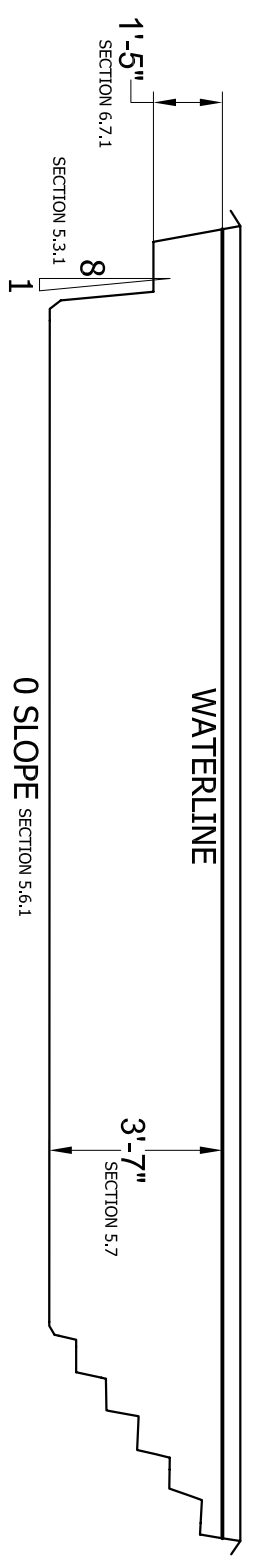
ELEVATION SCALE 1/4" = 1'-0"

AREA: 229 SQ.FT PERIMETER: 65 FT VOLUME: 6200 GAL