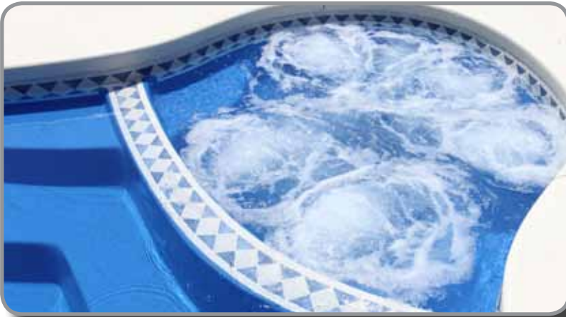
The Spa Section of the Mandalay Bay pool showing the Blue Iridium Finish